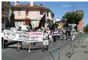
Fréjus. July 10 th 2004 Anti-bullfight march

Some more information on the above mentioned web sites