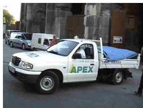
Nîmes Sept. 9 th 2004 Dead bull loaded on a regular rental truck