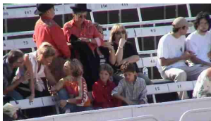
REJON Arles Sept. 12 th 2004 – Kids are watching also