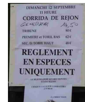
Arles, Sept. 12 th 2004

The answer is simple: money. Often black money, otherwise why is it that some corrida organisers do not accept checks and credit cards? If money is not the major goal behind the corrida organisations, why are the organisers exporting corrida to China, Iraq, and South America? To show the world how barbaric the Europeans are?